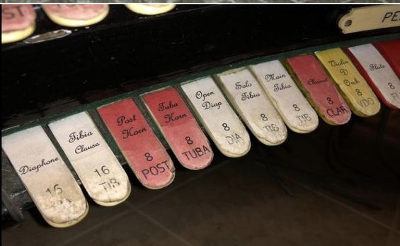
New console bolsters with SAMs. All stop tabs have had the old paper removed and cleaned.