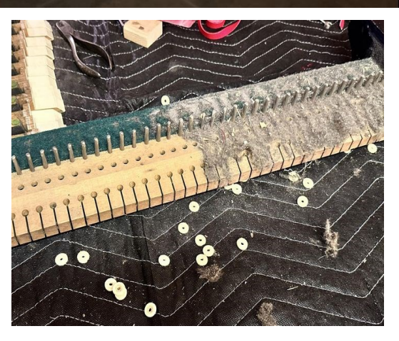
"Crud" removed from the keys